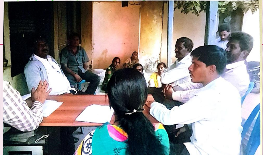
STUDENTS VISIT TO MAHAGAON GRAMPANCHAYAT AND DISCUSS TO SARPANCH, MEMBERS OF GRAMPANCHAYAT