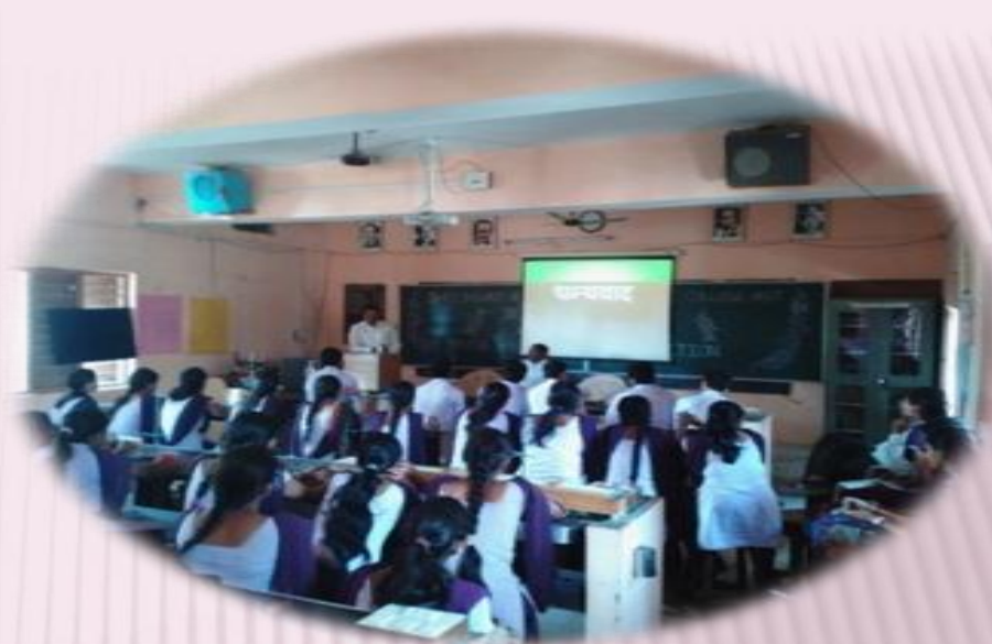
"BHARAT MAZA DESH AHE" ON DATE 27 FEB, 2016