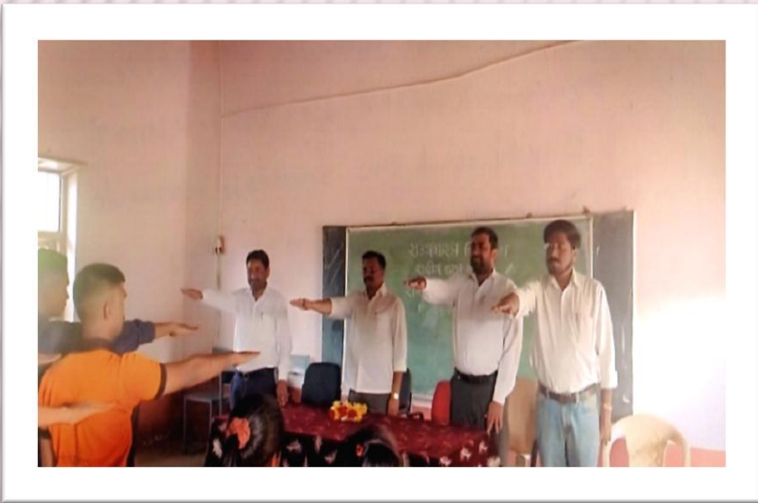
Taking Oath of Voter in Lok Sabha Election