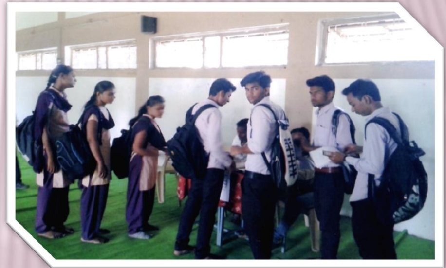
Students Registering New Voter Form