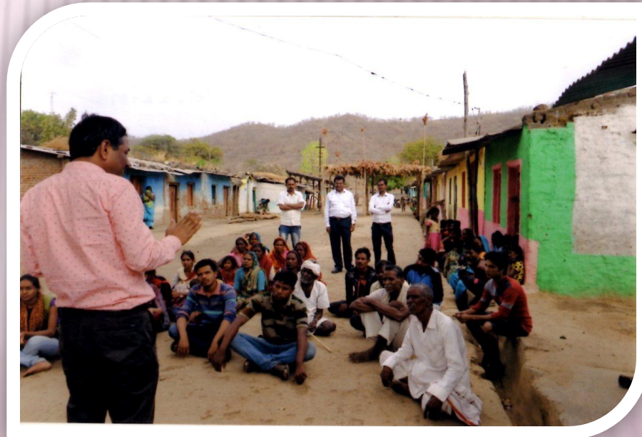
Student Awarng The Tribal Peoples About VVPAT At Shahanur Villege