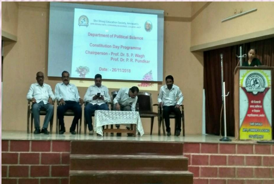
Organized Constitution Day Programme 26 Nov.2018