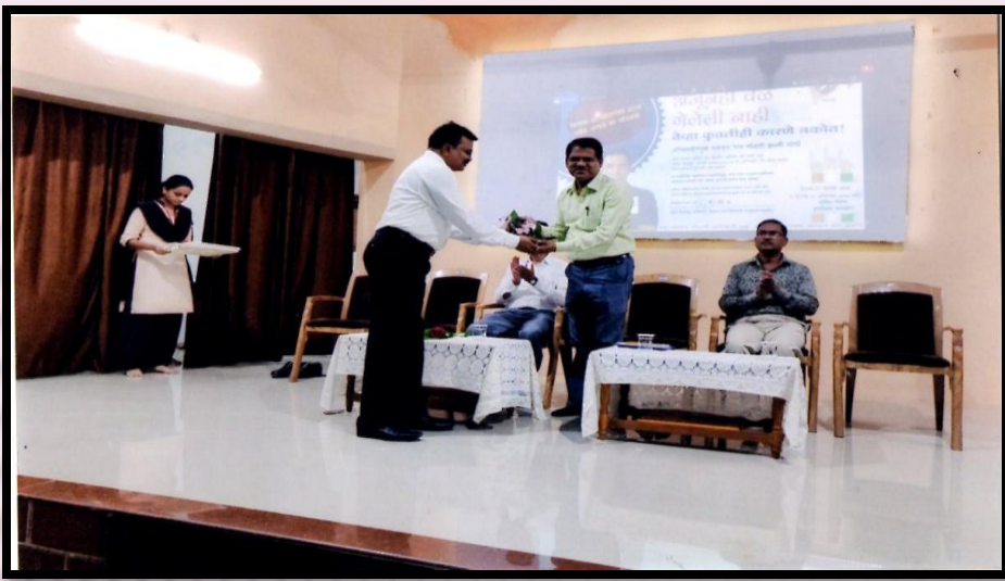
Tahsildar Akot, in New Voter Registration Programme