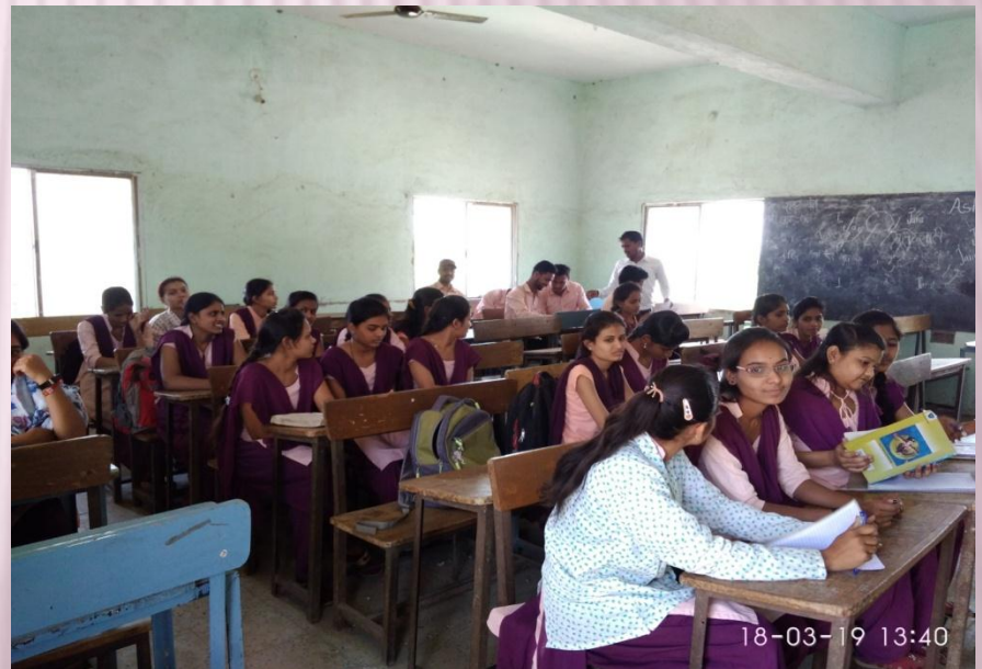
Students Participated in Group Discussion on House of Lords