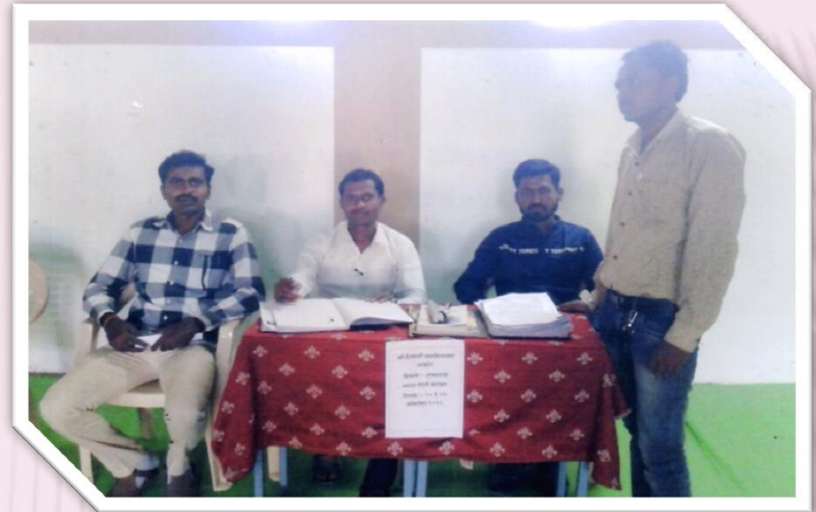
LEC Members Registering New Voters