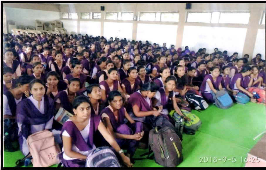
Attended Students in New Voter Registration Programme