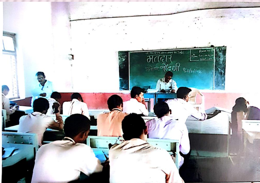
"REGISTRATION OF NEW VOTER CAMPAIGN" DURING 01/08/2016 TO 04/08/2016