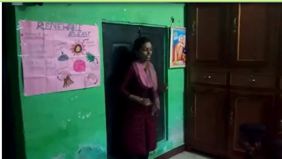
Student of B.Sc. Second year explained concept of renewable energy sources and E-waste management to Society Members.