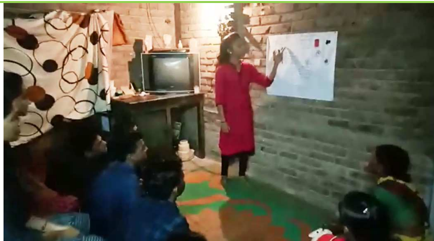
Student of B.Sc. Second year explained concept of renewable energy sources and E-waste management to Society Members.