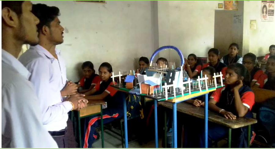
Student of B.Sc. Final year explained Science Model to School students in Akot City