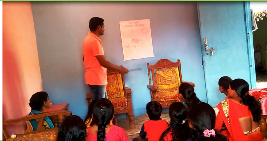
Student of B.Sc. Second year explained concept of renewable energy sources and E-waste management to Society Members.